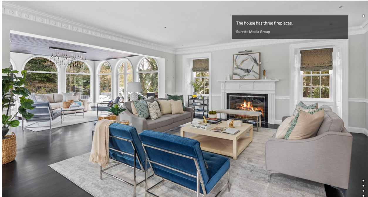
The house has three fireplaces.