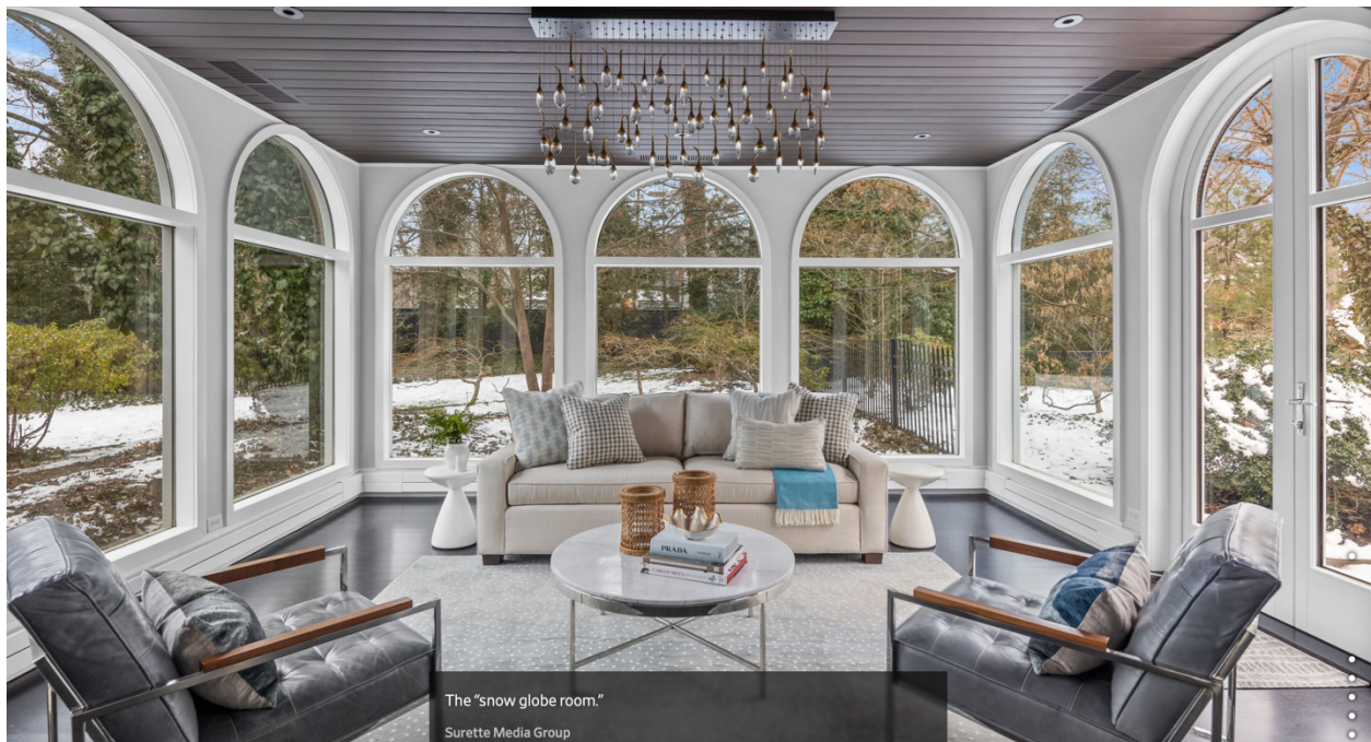
The "snow globe room."

Fox Corp. and Wall Street Journal parent News Corp share common ownership.