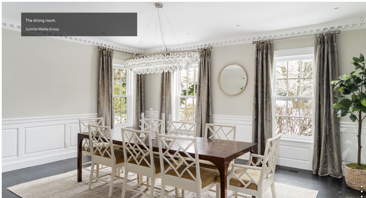
The dining room.