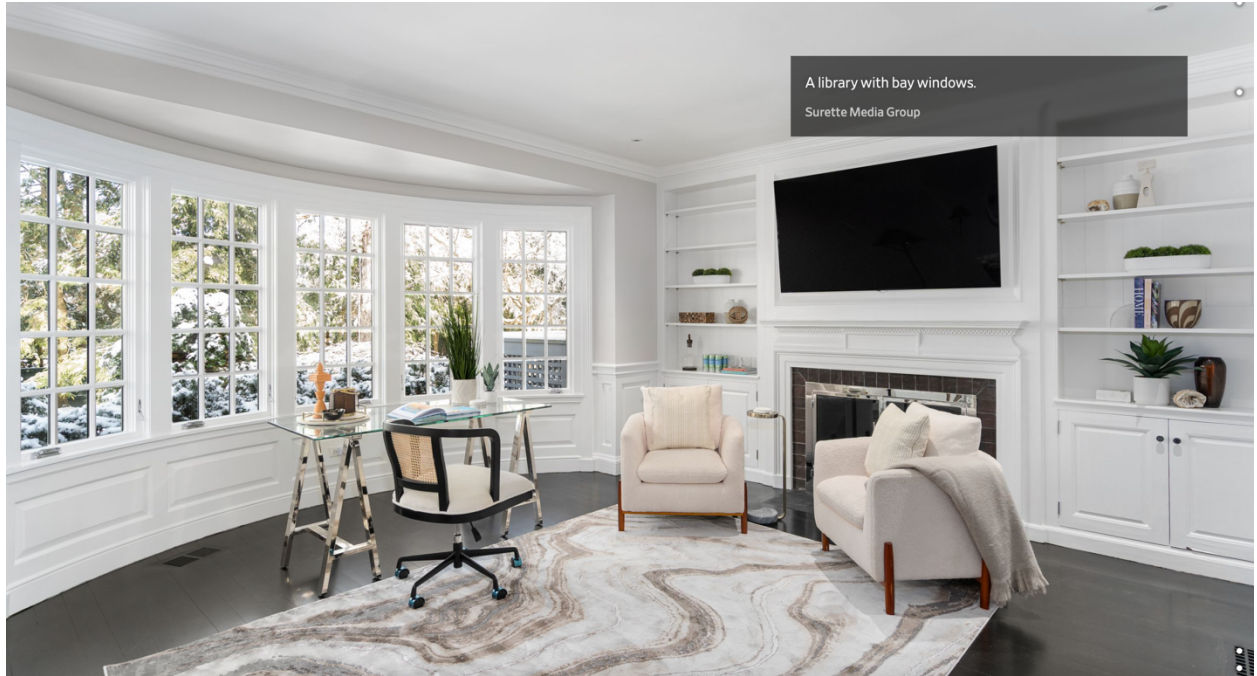
A library with bay windows.