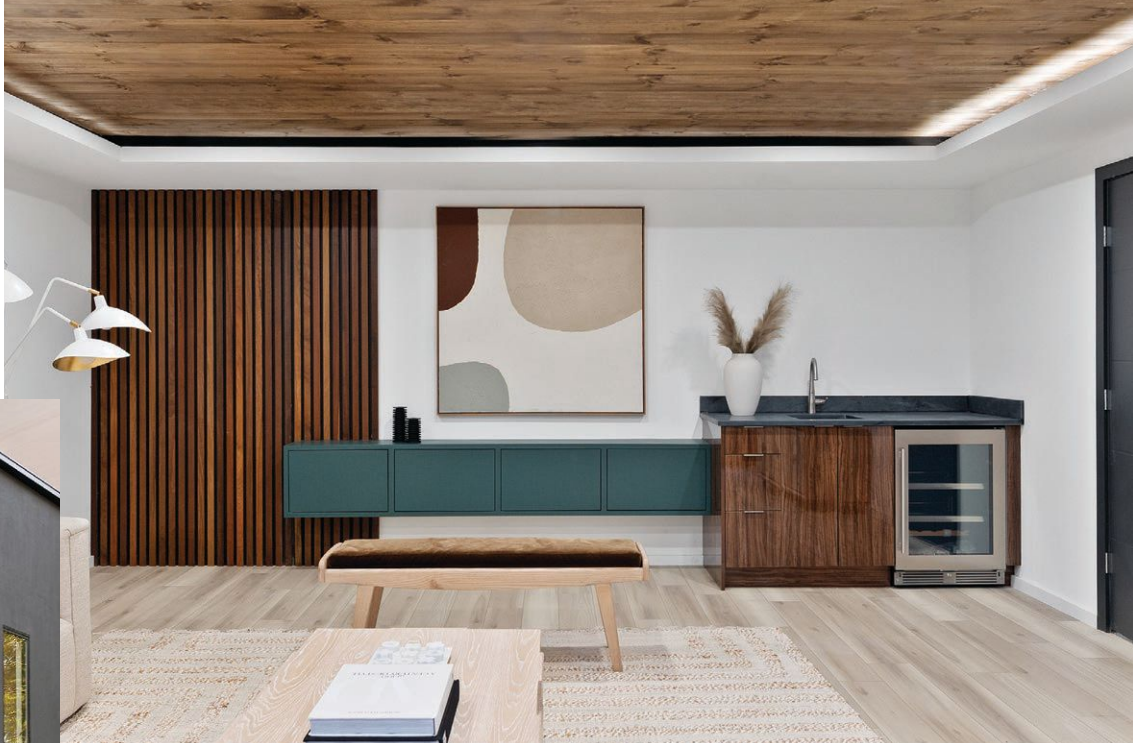
Clockwise from top right: A minimalist, Scandinavian design throughout the living spaces gives the home a serene ambiance; the staircase features contemporary, clean lines; the exterior merges with the surrounding natural environment by using the wood-alternative ACRE.